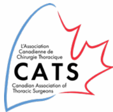
Canadian Association of Thoracic Surgeons (CATS)